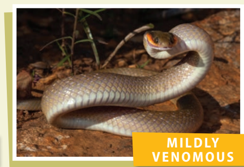
Herald or Red-lipped Snake (Crotaphopeltis hotamboeia)

Spotted Skaapsteker (Psammophylax rhombeatus rhombeatus)