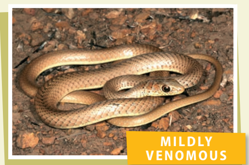
Short-snouted Grass Snake (Psammophis brevirostris)

Bibron's Stiletto Snake (Atractaspis bibronii)