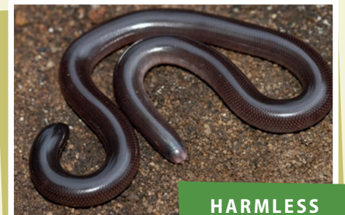
Cape Wolf Snake ( Lycophidion capense capense )