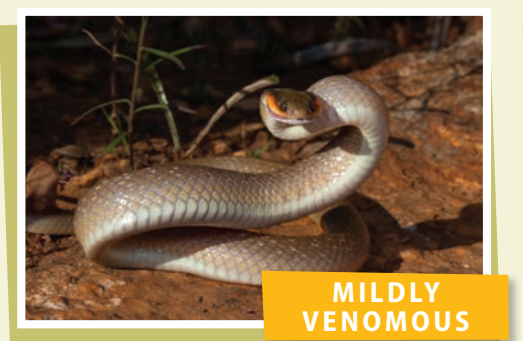
Herald or Red-lipped Snake (Crotaphopeltis hotamboeia)