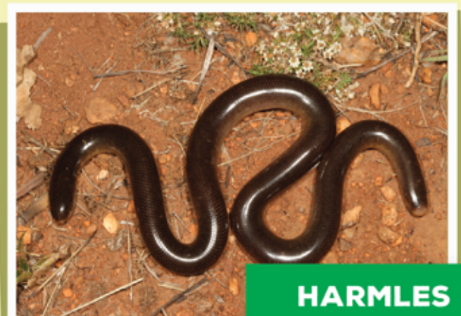
Bibron's Beaked Blind Snake Afrotyphlops bibronii