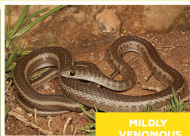
Short-snouted Grass Snake Psammophis brevirostris