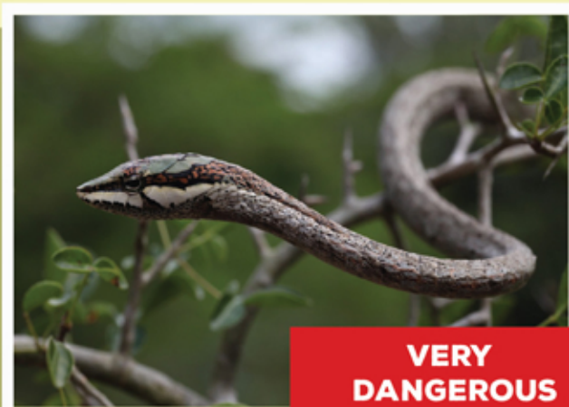
Southern Twig Snake Thelotornis capensis