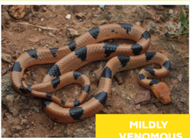
Eastern Tiger Snake Telescopus semiannulatus