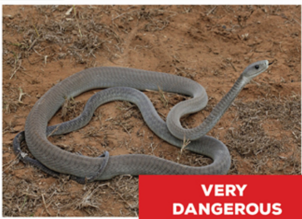
Black Mamba Dendroaspis polylepis