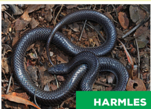
Common Wolf Snake Lycophidion capense