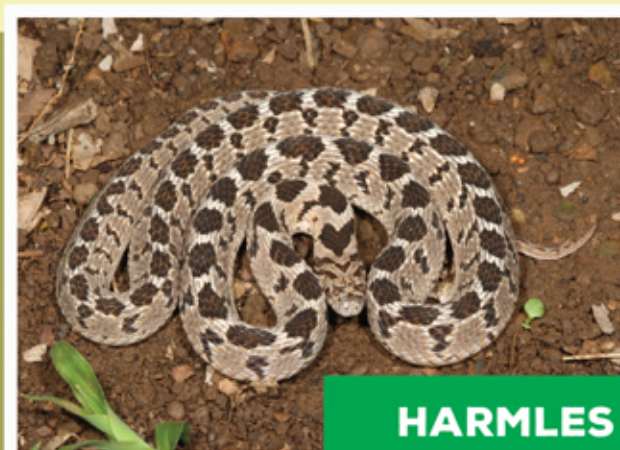
Rhombic Egg-eater Dasypeltis scabra