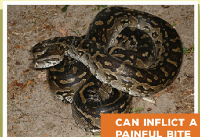
Southern African Python Python natalensis