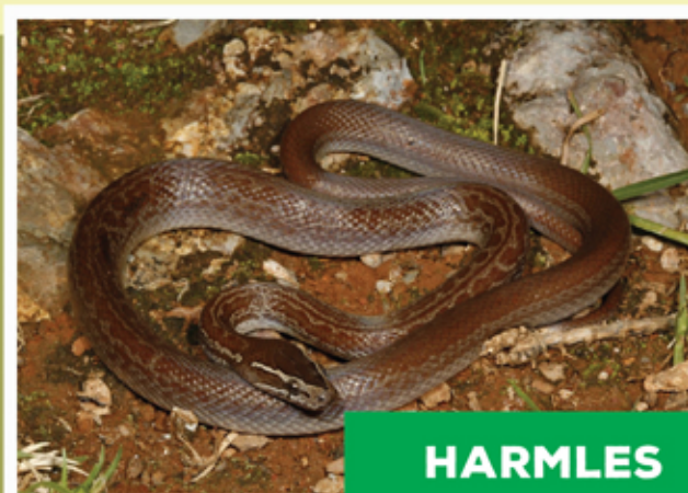
Brown House Snake Boaedon capensis