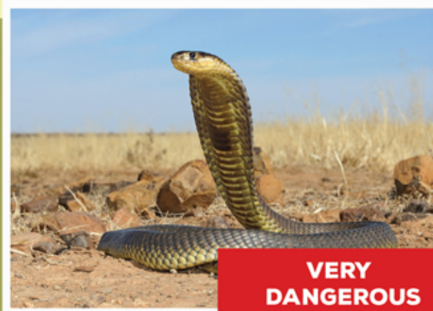
Snouted Cobra Naja annulifera