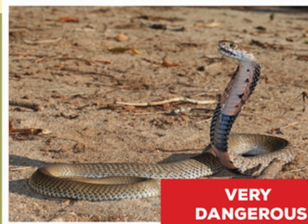
Mozambique Spitting Cobra Naja mossambica