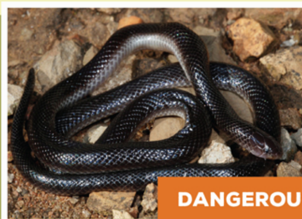
Bibron's Stiletto Snake Atractaspis bibronii