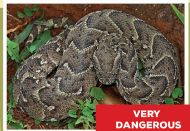
Puff Adder Bitis arietans