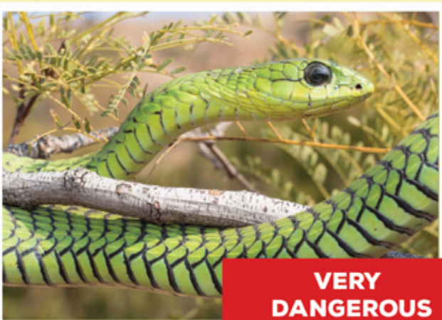
Boomslang - male Dispholidus typus