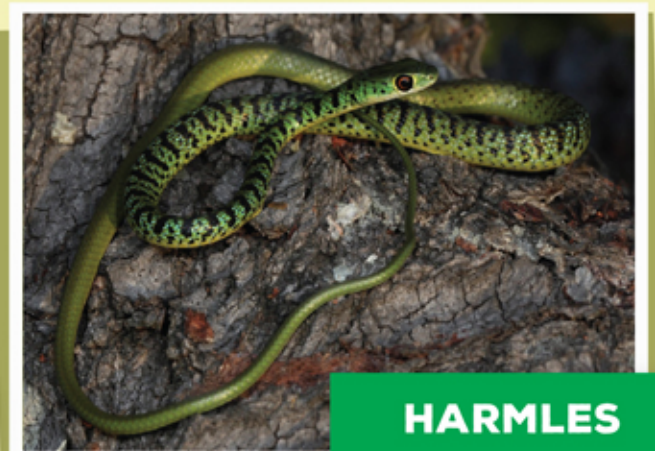
Spotted Bush Snake Philothamnus semivariegatus