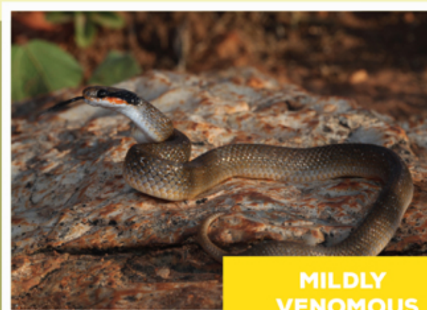
Herald Snake Crotaphopeltis hotamboeia