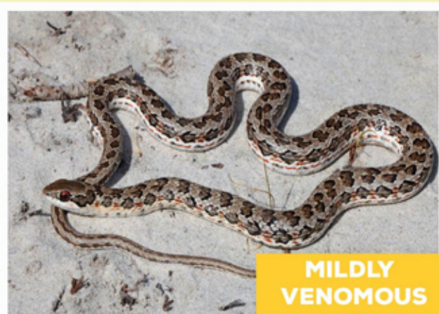
Spotted Skaapsteker ( Psammophylax rhombeatus )