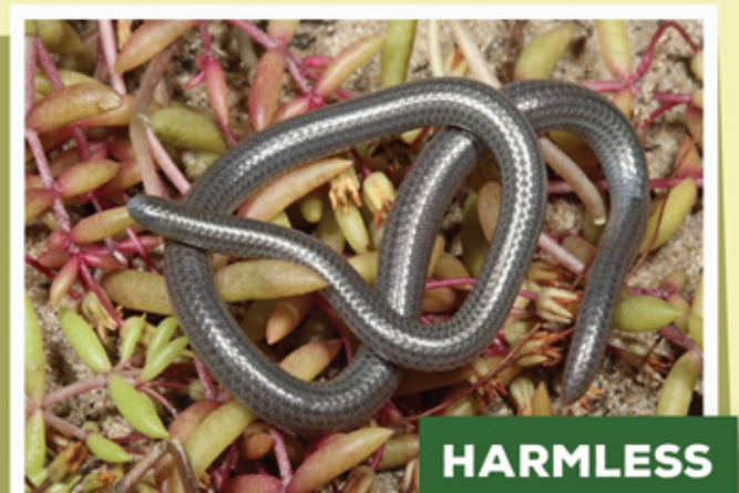
Black Thread Snake ( Leptotyphlops nigricans )