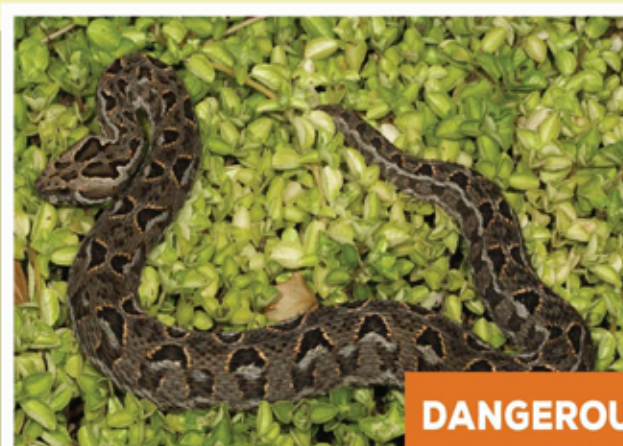
Berg Adder ( Bitis atropos )