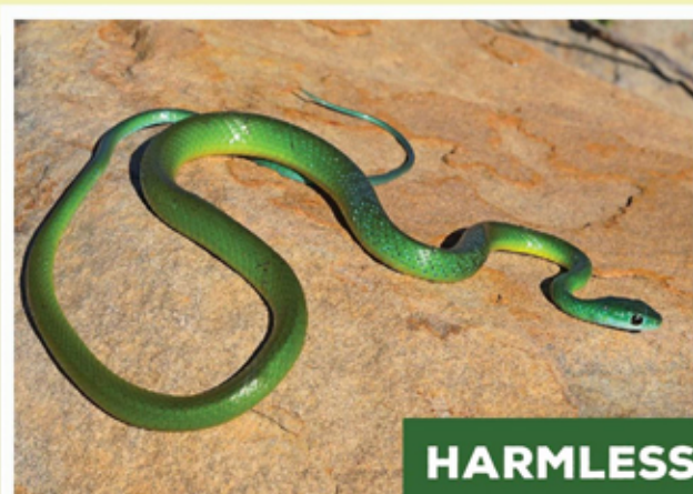
Western Natal Green Snake ( Philothamnus occidentalis )