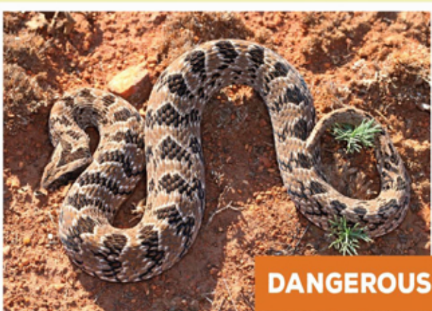
Rhombic Night Adder ( Causus rhombeatus )