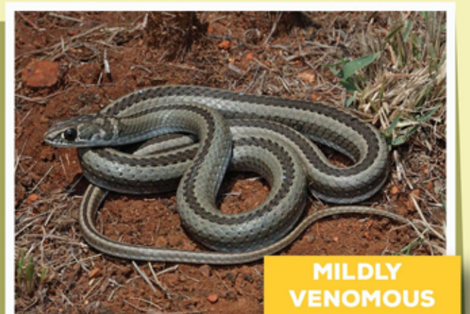
Cross-marked Grass Snake ( Psammophis crucifer )