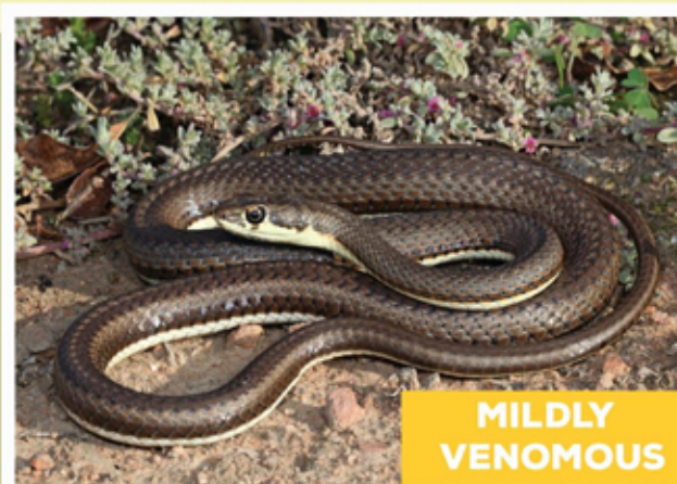
Karoo Sand Snake ( Psammophis notostictus )