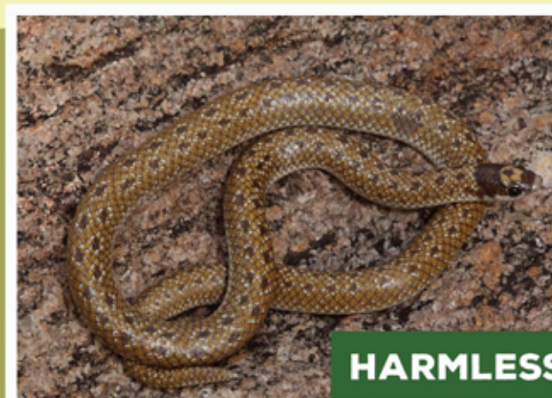
Sundevall's Shovel-snout ( Prosymna sundevallii )