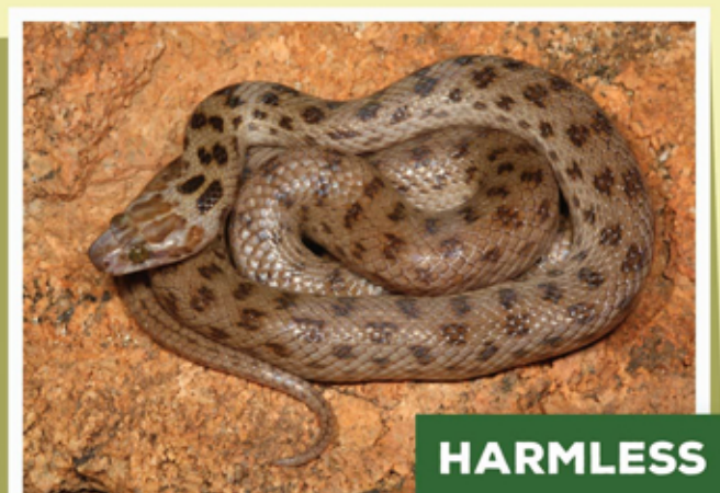
Spotted Rock Snake ( Lamprophis guttatus )