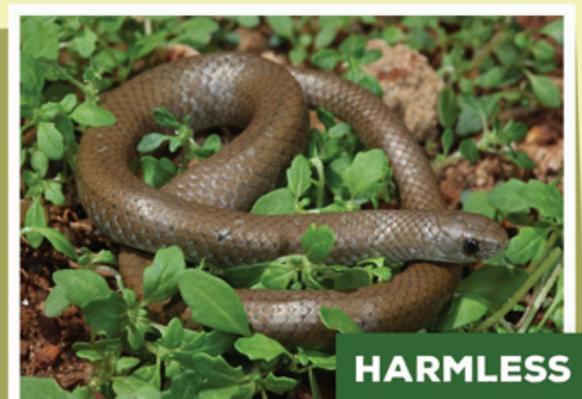
Common Slug-eater ( Duberria lutrix )