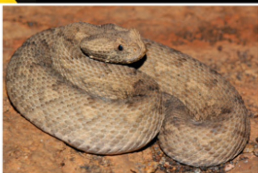
Marius Burger Graham Alexander

A small adder averaging 30 cm with a maximum size of 35 cm. This endemic snake is listed as Endangered in the current Reptile Atlas. It is largely limited to grasslands above 1,500 masl in the Sneeuwberg range and the surrounding mountains of Graaff-Reinet. The Plain Mountain Adder spends much of its time hiding under rocks and basks in the early morning and late afternoon. It lacks horns above the eyes. Nothing is known of the venom of this snake, but it is thought to be like that of other small adders, causing pain and swelling. Individuals usually hiss and strike when encountered. This snake probably feeds largely on lizards and small rodents.