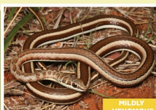
Western Yellow-bellied Sand Snake ( Psammophis subtaeniatus )