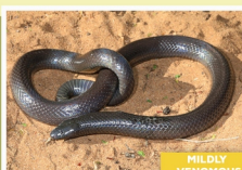
Common Purple-glossed Snake ( Amblyodipsas polylepis )