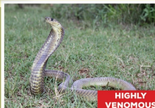
Spouted Cobra ( Naja annulifera )