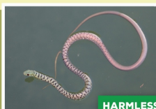
Spotted Bush Snake ( Philothamnus semivariegatus )