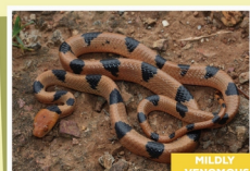
Eastern Tiger Snake ( Teloscopus semiannulatus )