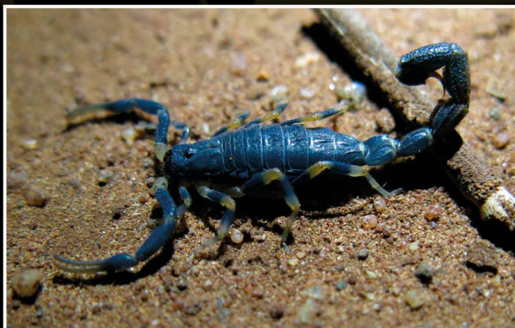
Ryan van Huyssteen

A small scorpion under 5 cm with the tail extended. A black to dark blue/olive scorpion with banded legs and pincers. The joints of the legs and tips of the pincers are usually light yellow to orange. In South Africa it is only found in the lowveld of Limpopo from Kruger Park in the east to the Botswana border in the west. It is found under rocks and debris usually on hard soils. It is also active on warm nights. It may be confused with other lesser-thicktail scorpions, especially the Olive Lesser-thicktail and the dark form of Highveld Lesser-thicktail. The sting of this species may cause pain but is not medically important.