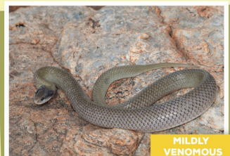
Herald Snake ( Crotaphopeltis hotaemboeia )