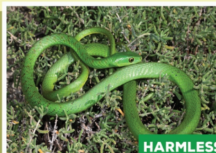
Eastern Natal Green Snake ( Philothamnus natalensis )