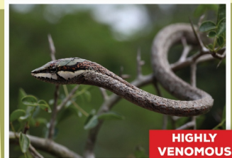
Southern Vine Snake ( Thelotornis c. capensis )