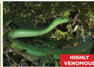
Green Mamba ( Dendroaspis angusticeps )