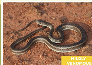
Short-nouted Grass Snake ( Psammophis brevirostris )