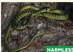
Spotted Bush Snake ( Philothamnus semivariegatus )