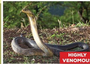
Brown Forest Cobra ( Naja subfulva )