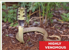
Snouted Cobra - juvenile ( Naja annulifera )