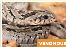
Common Night Adder ( Causus rhombeus )