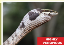
Southern Vine Snake ( Thelotornis capensis )