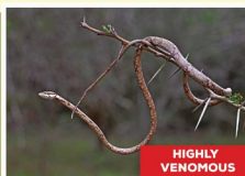
Southern Vine Snake ( Thelotornis capensis )