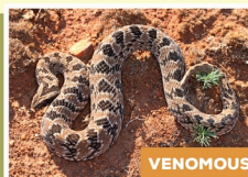
Common Night Adder ( Causus rhombeus )