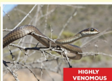
Boomslang - female ( Dispholidus typus )