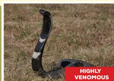
Rinkhals ( Hemachatus haemachatus )