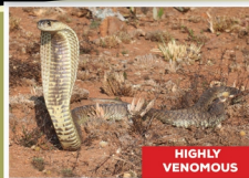
Snouted Cobra ( Naja annulifera )

Painful bite, but does not require antivenom