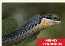
Boomslang - juvenile ( Dispholidus typus )