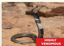
Rinkhals - juvenile ( Hemachatus haemachatus )