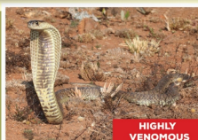
Snouted Cobra - standard form ( Naja annulifera )