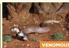
Intermediate Shield-nose Snake ( Aspidelaps scutatus intermedius )