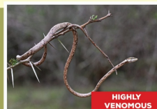
Southern Vine Snake ( Thelornis capensis )