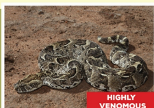
Puff Adder ( Bitis atropus )