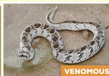
Snouted Night Adder ( Causus d'ellipii )