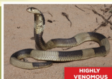
Snouted Cobra - banded form ( Naja annulifera )