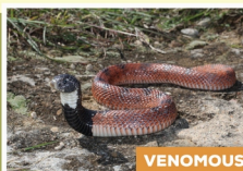
Speckled Shield-nose Snake ( Aspidelaps scutatus scutatus )