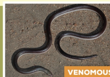
Bibron's Sciletto Snake ( Atractaspis bibronii )