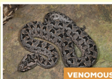
Berg Adder ( Bitis atropus )