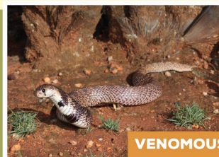
Intermediate Shield-nose Snake ( Aspidelaps scutatus intermedius )