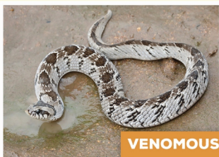
Spouted Night Adder ( Causus defilippii )