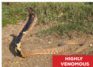
Rinkhals - banded form ( Hemachatus haemachatus )