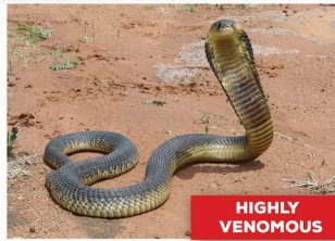
Spouted Cobra ( Naja annulifera )