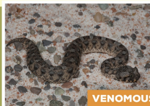
Horned Adder ( Bitis caudalis )