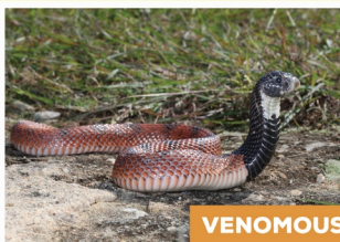
Speckled Shield-nose Snake ( Aspidelaps scutatus )