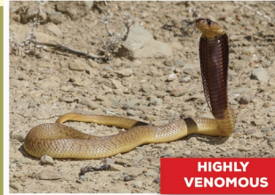
Cape Cobra - juvenile ( Naja nivea )