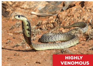
Snouted Cobra - juvenile ( Naja annulifera )