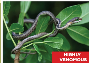
Boomslang - juvenile ( Dispholidus typus )