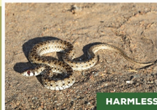
Mole Snake - juvenile ( Pseudaspis cana ) HARMLESS