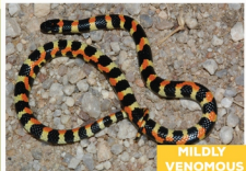
Spotted Harlequin Snake ( Homoroselaps lacteus ) MILDLY VENOMOUS