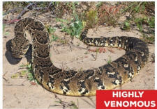
Puff Adder ( Bitis arietans ) HIGHLY VENOMOUS