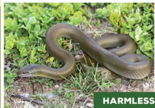
Olive Snake ( Lycodonomorphus inornatus ) HARMLESS