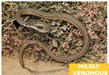
Cape Sand Snake ( Psammophis leightoni ) MILDLY VENOMOUS