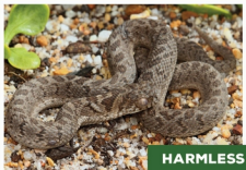
Common Egg-eater ( Dasypeltis scabra ) HARMLESS