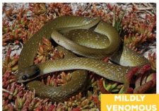
Herald Snake ( Crotaphopeltis hotamboeia ) MILDLY VENOMOUS