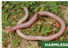
Delalande's beaked Blind Snake ( Rhinotyphlops kalandae ) HARMLESS