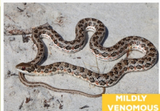
Spotted Skaapsteker ( Psammophylax rhombatus ) MILDLY VENOMOUS