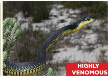
Boomslang - male ( Dispholidus typus ) HIGHLY VENOMOUS