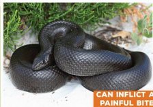
Mole Snake - adult ( Pseudaspis cana ) CAN INFLICT A PAINFUL BITE