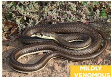
Karoo Sand Snake ( Psammophis notostictus ) MILDLY VENOMOUS