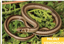
Cross-marked Grass Snake ( Psammophis crucifer ) MILDLY VENOMOUS