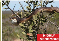
Boomslang - female ( Dispholidus typus ) HIGHLY VENOMOUS