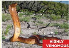
Cape Cobra ( Naja nivea ) HIGHLY VENOMOUS