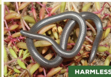
Black Thread Snake ( Leptotyphlops nigricans ) HARMLESS