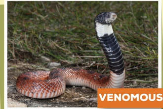
Speckled Shield-nose Snake ( Aspidelaps s. scutatus )