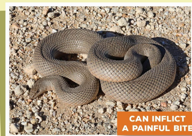
Mole Snake - grey form ( Pseudaspis cana )