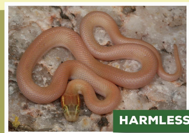
Bug-eyed House Snake ( Boaedon mentalis )