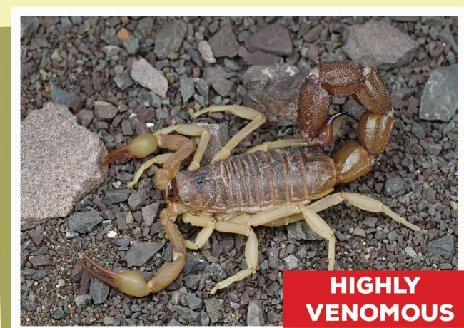
Rough Thicktail Scorpion ( Parabuthus granulatus)