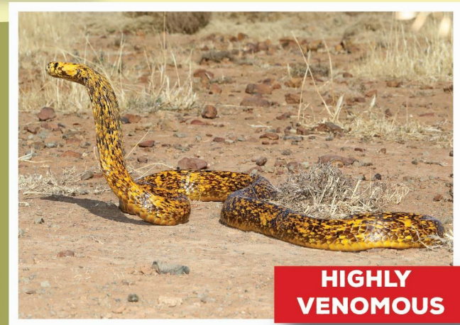
Cape Cobra ( Naja nivea )