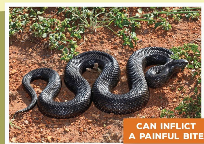
Mole Snake - black form ( Pseudaspis cana )