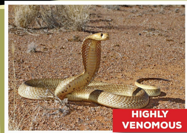
Cape Cobra ( Naja nivea )