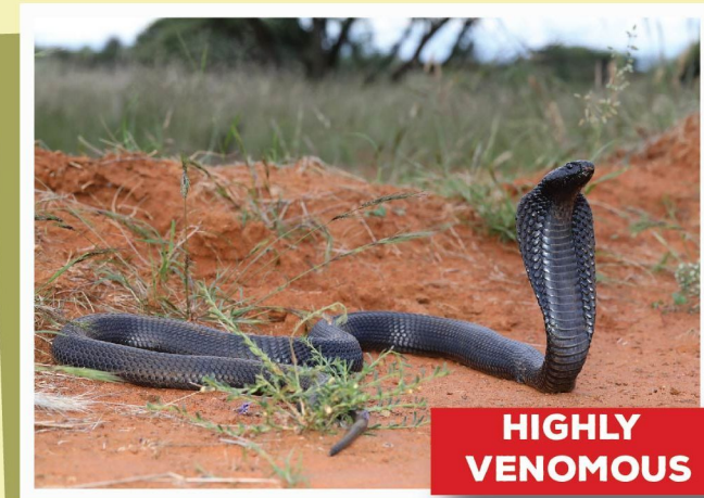
Black Spitting Cobra ( Naja nigricincta woodi )