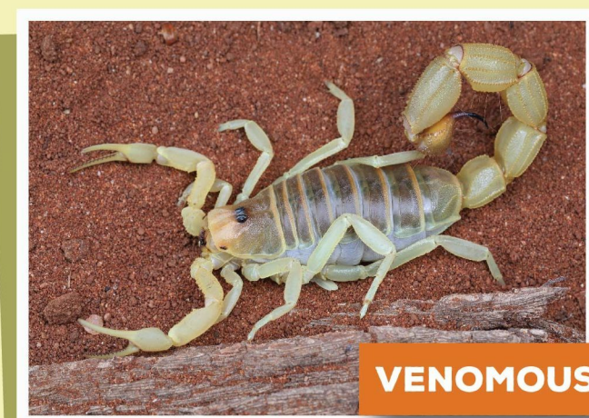
Kalahari Thicktail Scorpion ( Parabuthus raudus )