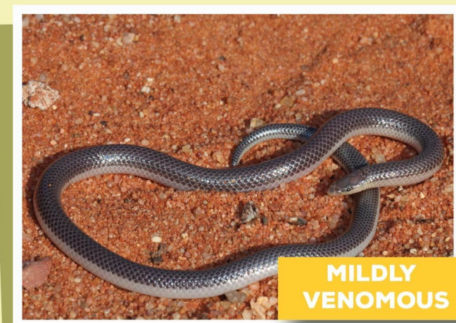
Bicoloured Quill-snouted Snake ( Xenocalamus bicolor )