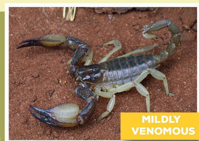
Radiant Burrower ( Opisthophthalmus carinatus )