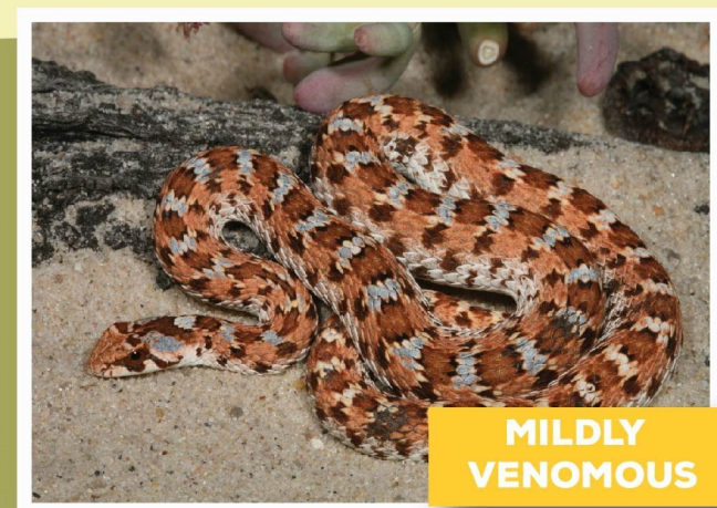
Dwarf Beaked Snake ( Dipsina multimaculata )