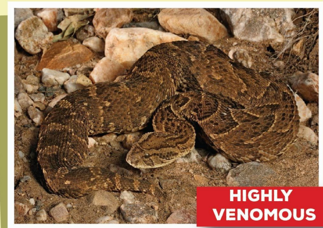
Puff Adder ( Bitis arietans )