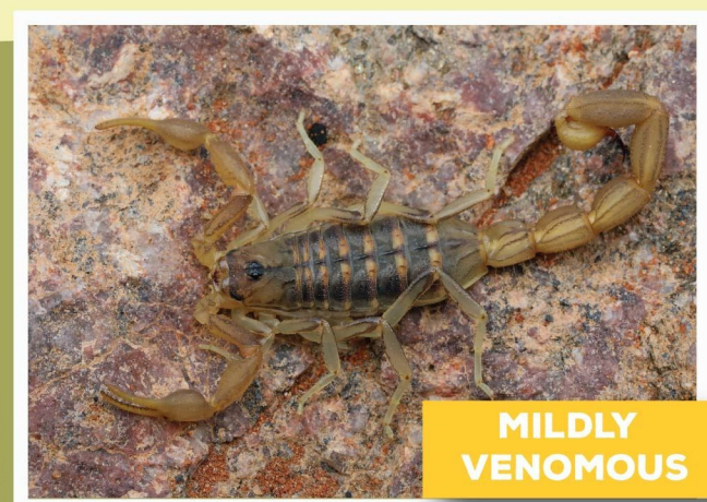
Common Lesser-thicktail Scorpion ( Uroplectes carinatus )