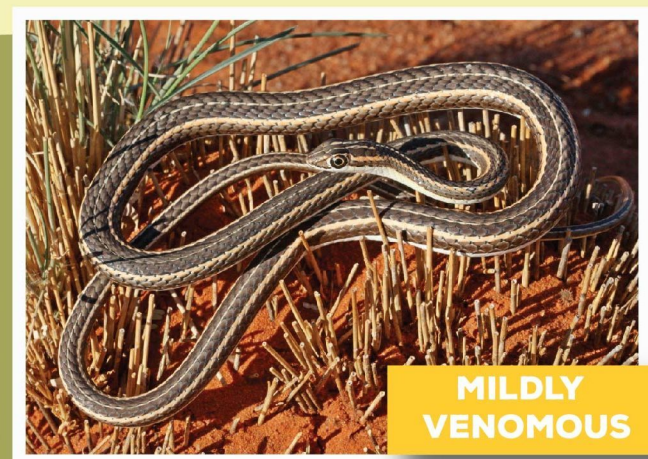
Fork-marked Sand Snake ( Psammophis trinasalis )