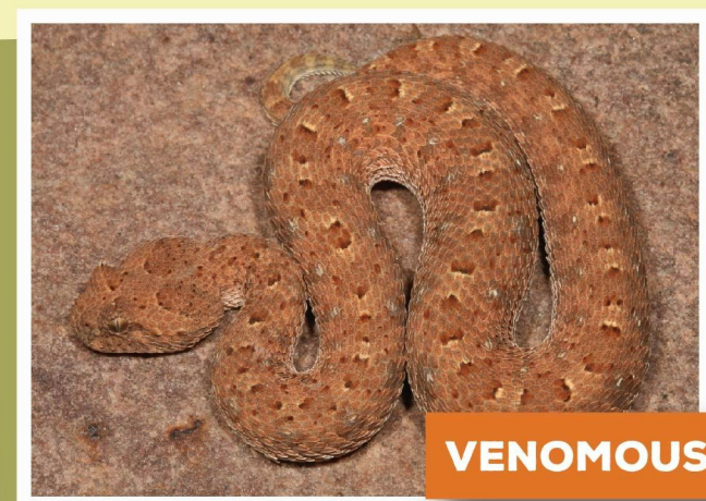
Horned Adder ( Bitis caudalis )