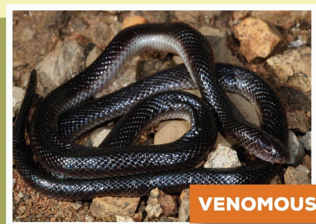
Bibron's Stiletto Snake ( Atractaspis bibronii )