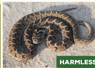
Rhombic Egg-eater ( Dasypeltis scabra )