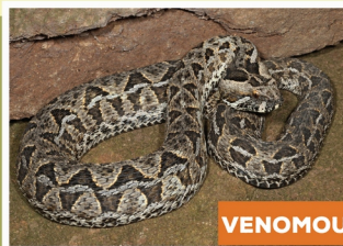
Berg Adder ( Bitis atropos )