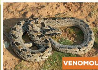
Rhombic Night Adder ( Causus rhombeatus )