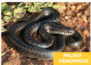
Many-spotted Reed Snake ( Amplorhinus multimaculatus )