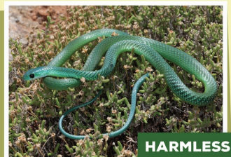
Western Natal Green Snake ( Philothamnus occidentalis )