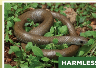
Common Slug-eater ( Duberria lutrix )