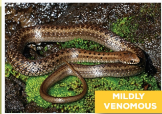
Many-spotted Reed Snake ( Amplorhinus multimaculatus )