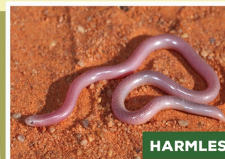
Delalande's Beaked Blind Snake ( Rhinotyphlops lalandei )