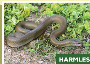
Olive Snake ( Lycodonomorphus inornatus )