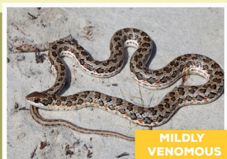
Spotted Skaapsteeker ( Psammophylax rhombeatus )