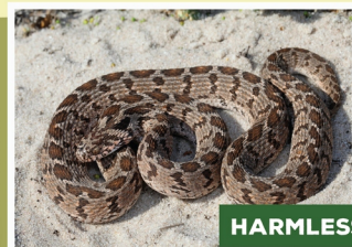
Rhombic Egg-eater ( Dasypeltis scabra )