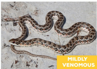
Spotted Skaapsteker Psammophylax rhombatus