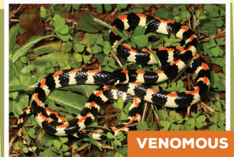
Spotted Harlequin Snake Homoroselaps lacteus