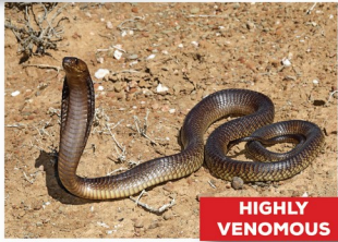
Cape Cobra Naja nivea