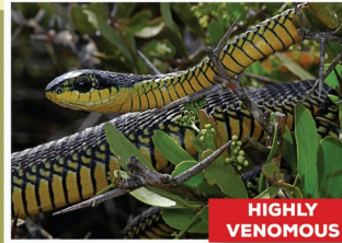
Boomslang - male Dispholidus typus