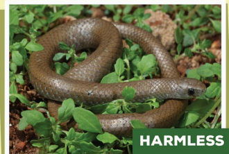
Common Slug-eater Duberria lutrix