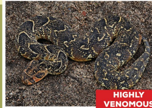
Puff Adder Bitis arietans