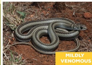
Cross-marked Grass Snake Psammophis crucifer