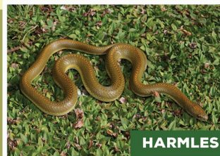
Aurora House Snake Lamprophis aurora