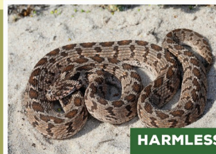
Rhombic Egg-eater Dasypeltis scabra