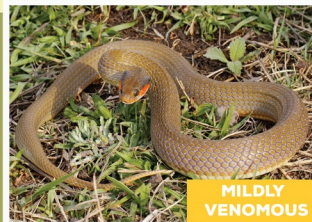
Herald Snake Crotaphopeltis hotamboeia