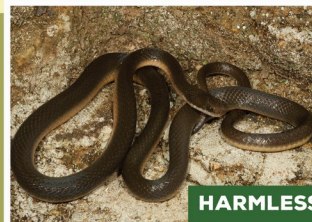
Brown Water Snake Lycodonomorphus rufulus