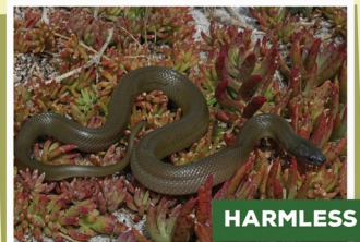
Olive Snake Lycodonomorphus inornatus