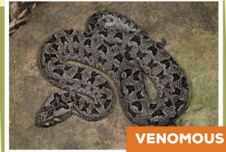
Berg Adder Bitis atropos