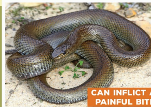
Mole Snake Pseudaspis cana