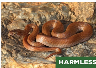
Brown House Snake Boaedon capensis