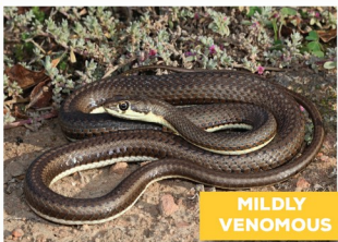
Karoo Sand Snake Psammophis notostictus