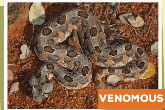
Horned Adder ( Bitis caudalis )