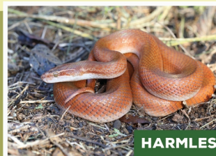
Brown House Snake ( Boaedon capensis )