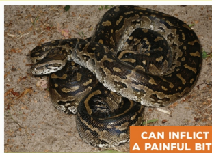
Southern African Python ( Python natalensis )