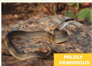
Herald Snake ( Crotaphopeltis hotamboeia )