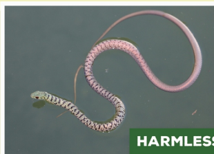
Spotted Bush Snake ( Philothamnus semivariegatus )