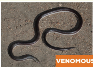
Bibron's Stiletto Snake ( Atractaspis bibronii )