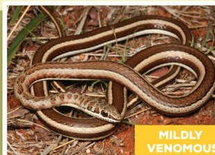
Western Yellow-bellied Sand Snake ( Psammophis subtaeniatus )