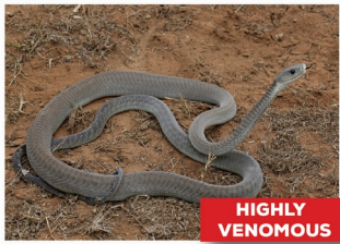
Black Mamba ( Dendroaspis polylepis )