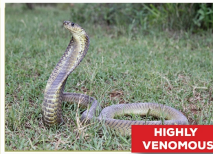
Snouted Cobra ( Naja annulifera )