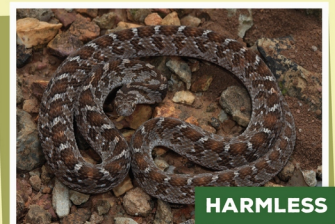
Common Egg-eater ( Dasypeltis scabra )