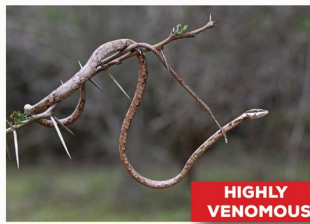
Southern Vine Snake ( Thelotornis capensis )