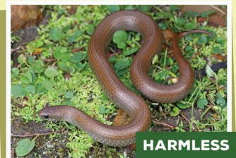
Common Slug-eater ( Duberrina lutrix )