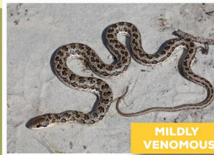
Spotted Skaapsteker ( Psammophylax rhombatus )