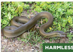
Olive Snake ( Lycodonormorphus inornatus )