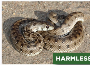
Mole Snake - juvenile ( Pseudaspis cana )