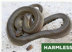
Brown Water Snake ( Lycodonormorphus rufulus )