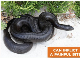
Mole Snake - adult ( Pseudaspis cana )