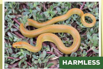
Aurora House Snake ( Lamprophis aurora )