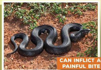
Mole Snake ( Pseudaspis cana )