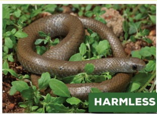
Common Slug-eater ( Dubertia lutrix )