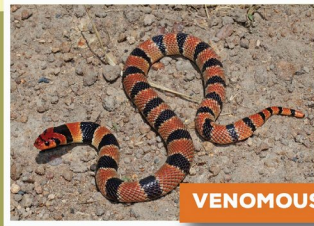
Cape Coral Snake ( Aspidelaps lubricus )