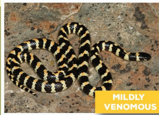
Spotted Harlequin ( Homoroselaps lacteus )