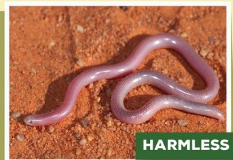
Delalande's Beaked Blind Snake ( Rhinyophlops lalandei )