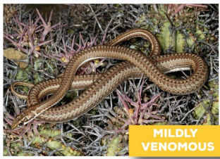
Karoo Sand Snake ( Psammophis notostictus )