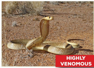
Cape Cobra - adult ( Naja nivea )