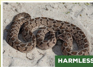
Common Egg-eater ( Dasypeltis scabra )