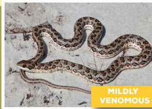
Spotted Skaapsteker ( Psammophylax rhombatus )