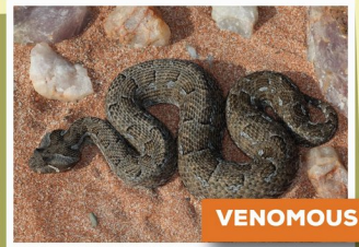
Red Adder ( Bitis rubida )