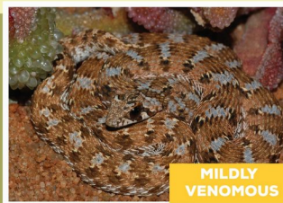
Dwarf Beaked Snake ( Dipsina multimaculata )