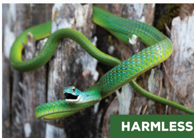
Common Bush Snake ( Philothamnus irregularis )