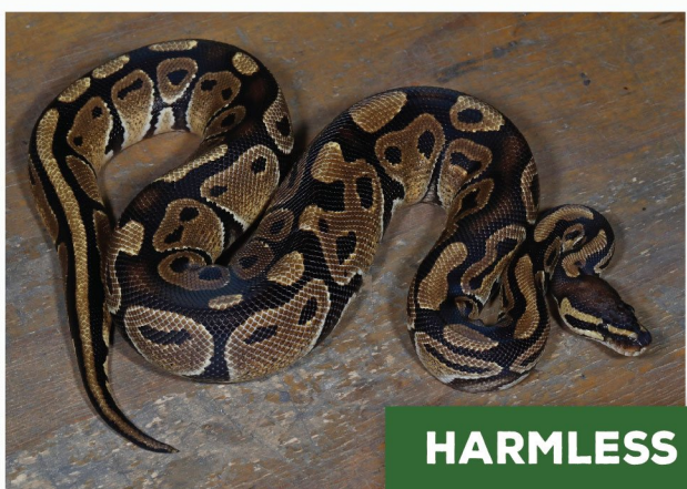
Ball Python ( Python regius )