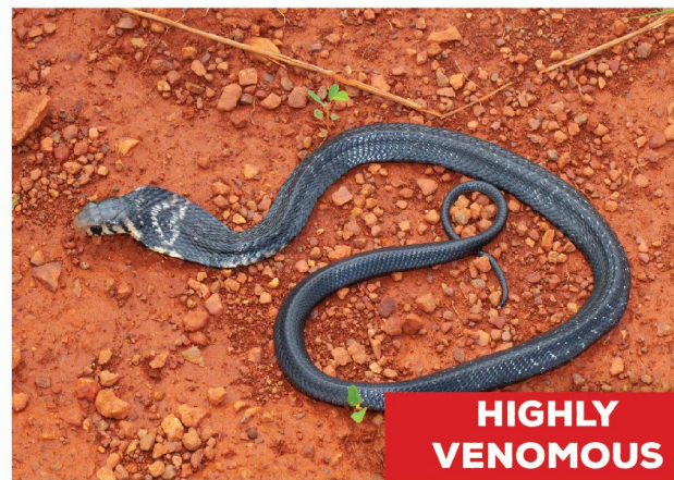
Forest Cobra ( Naja melanoleuca/savannula )