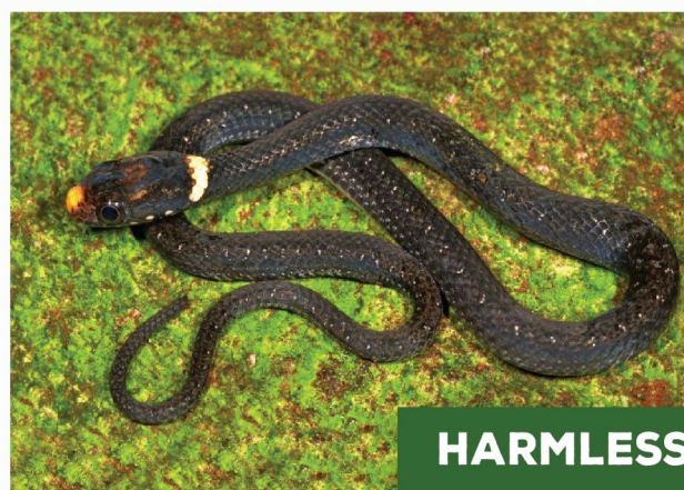
Variegated Marsh Snake ( Natriciteres variegata)