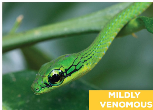
Common Emerald Snake ( Hapsidophrys smaragdina )