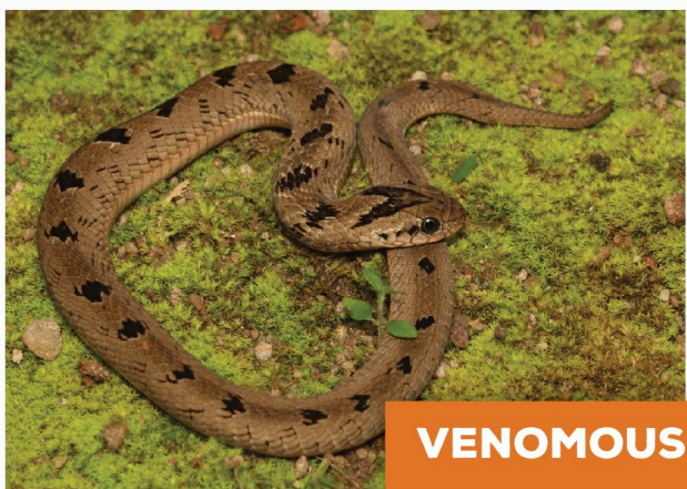
Spotted Night Adder ( Causus maculatus )