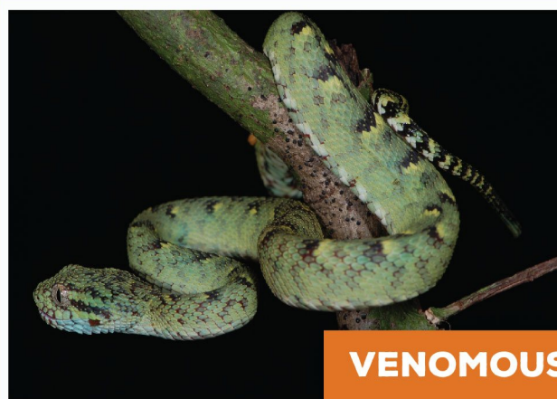
Western Bush Viper ( Atheris chlorechis )