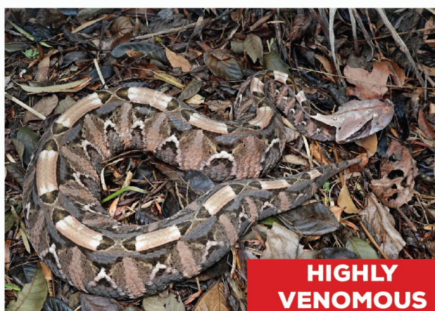
Western Gaboon Adder ( Bitis rhinoceros )