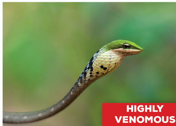
Forest Vine Snake ( Thelotornis kirtlandii )