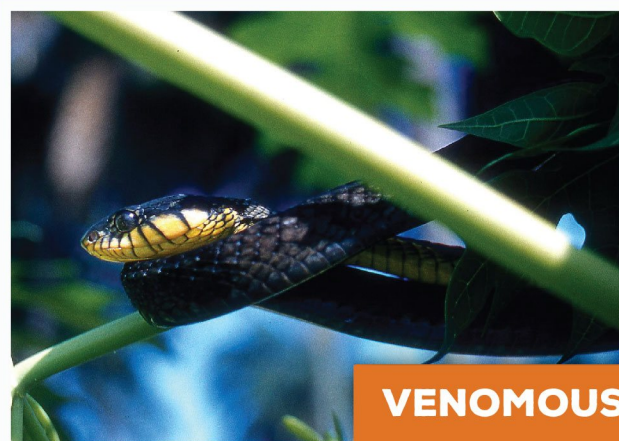
Blanding's Tree Snake - male ( Toxicodryas blandingii )