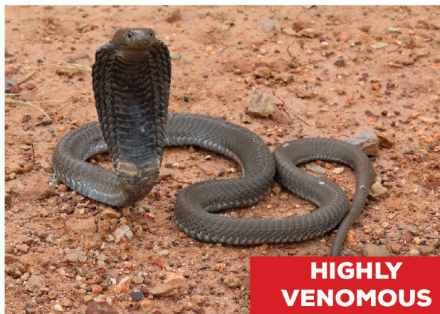
Black-necked Spitting Cobra - juvenile ( Naja nigricollis )