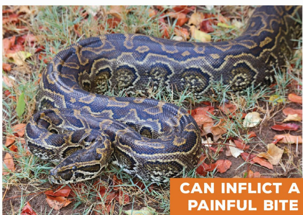
African Rock Python ( Python sebae )