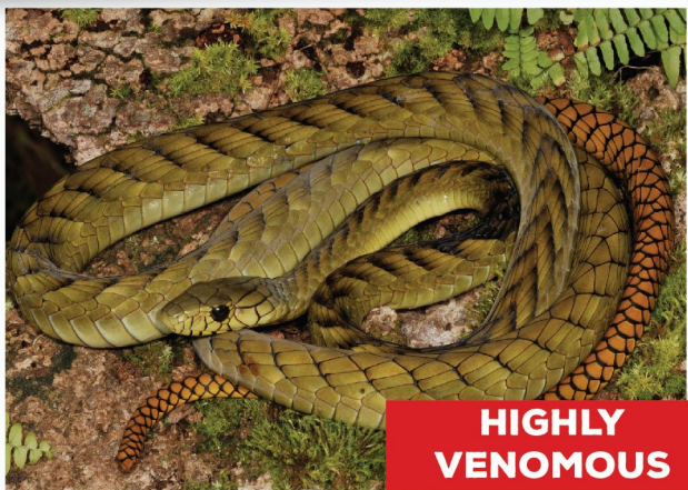
Western Green Mamba ( Dendroaspis viridis )