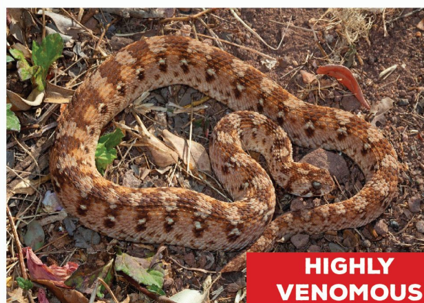
Carpet Viper ( Echis romani/ocellatus )