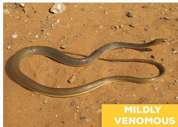
Olive Grass Snake ( Psammophis sp. )