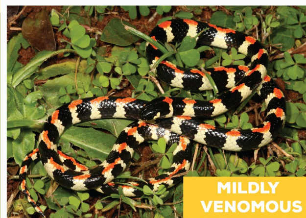
Spotted Harlequin ( Homoroselaps lacteus )