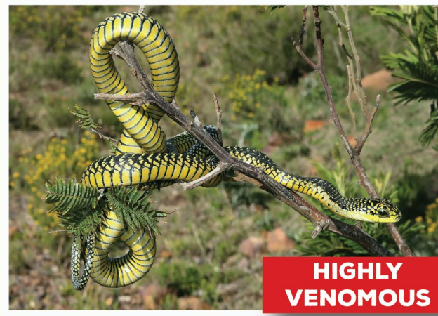
Boomslang - male ( Dispholidus typus )