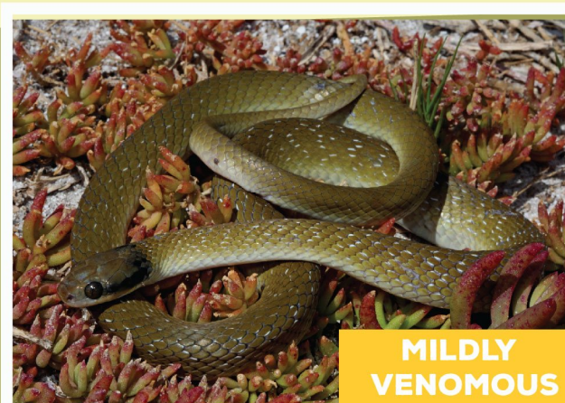
Herald Snake ( Crotaphopeltis hotamboeia )