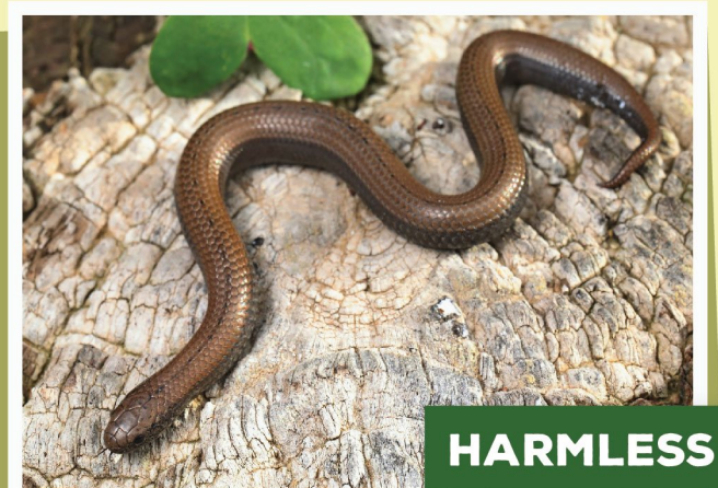
Common Slug-eater ( Duberria lutrix)