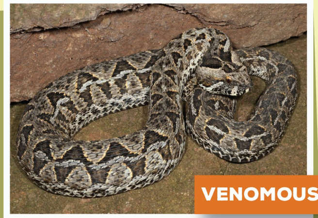
Berg Adder ( Bitis atropos )