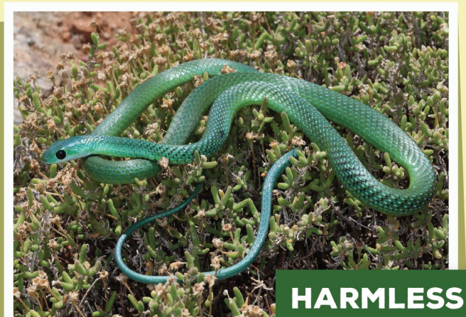
Western Natal Green Snake ( Philothamnus occidentalis )