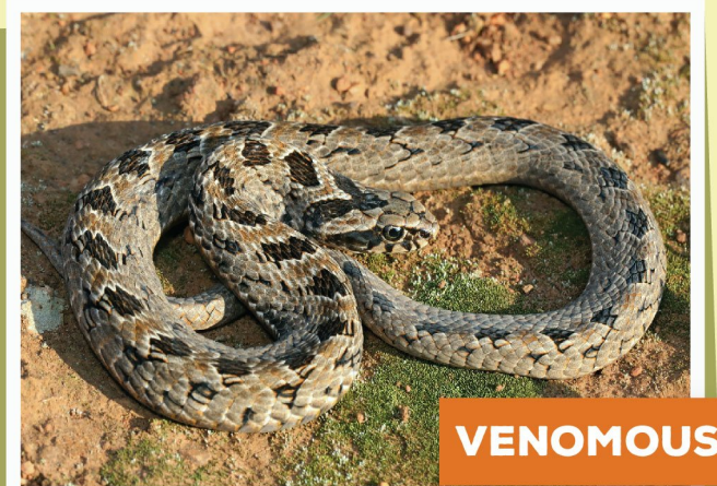
Common Night Adder ( Causus rhombeatus )