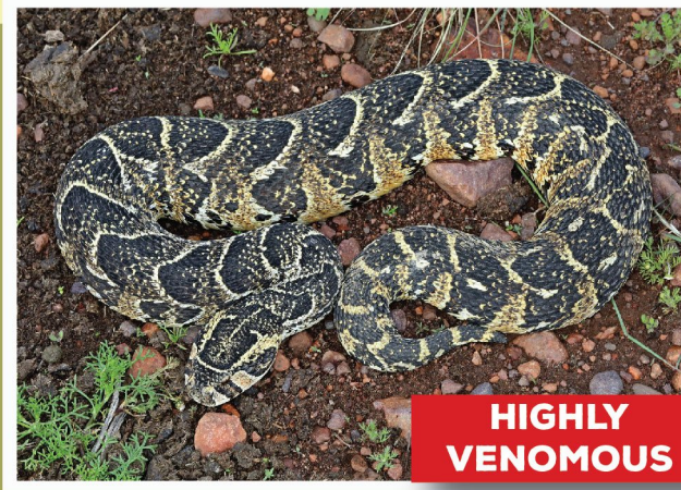
Puff Adder ( Bitis arietans )