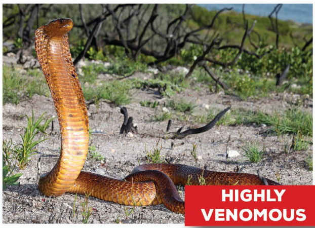
Cape Cobra ( Naja nivea )