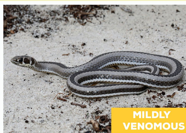
Cross-marked Grass Snake ( Psammophis crucifer )