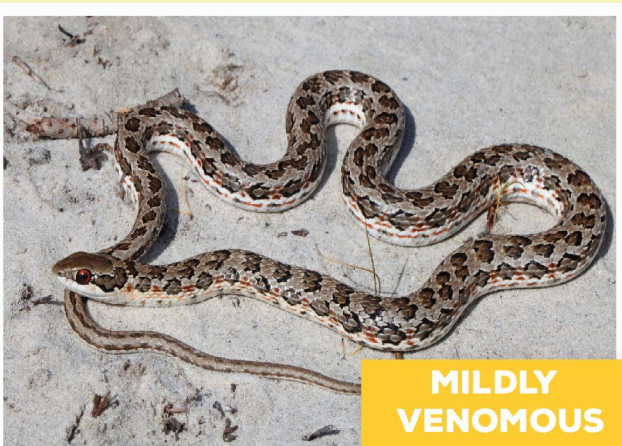
Spotted Skaapsteker ( Psammophylax rhombeatus )