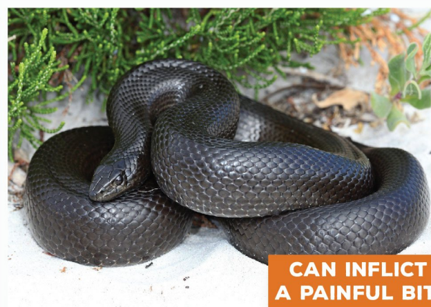
Mole Snake ( Pseudaspis cana )