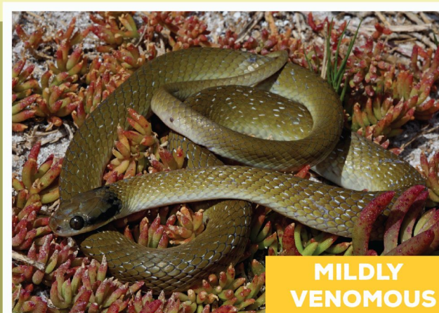
Herald Snake ( Crotaphopeltis hotamboeia )