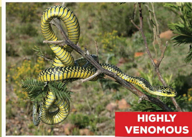
Boomslang - male ( Dispholidus typus )