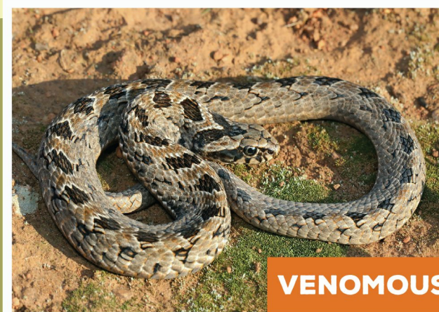
Common Night Adder ( Causus rhombeatus )