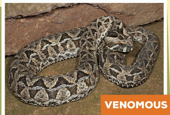
Berg Adder ( Bitis atropos )