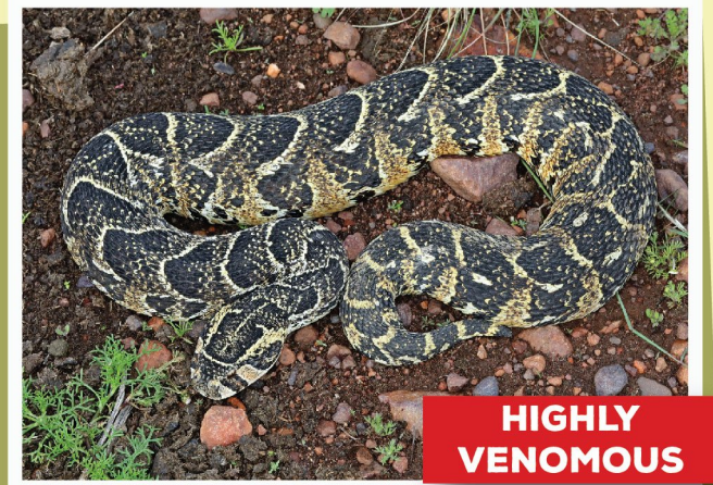
Puff Adder ( Bitis arietans )