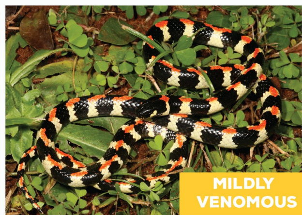
Spotted Harlequin ( Homoroselaps lacteus )