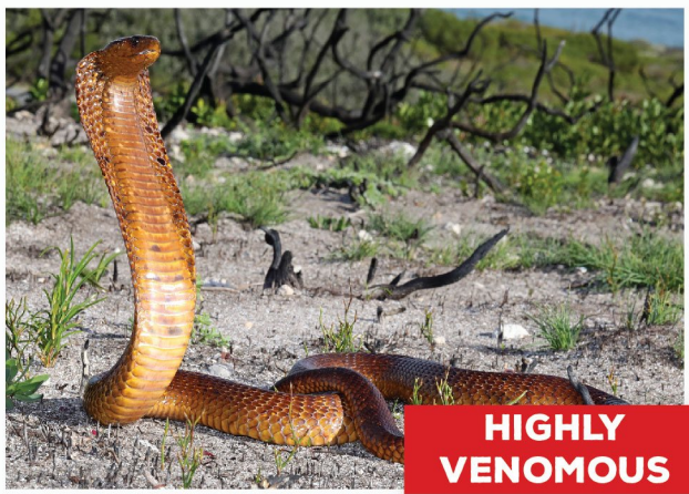
Cape Cobra ( Naja nivea )