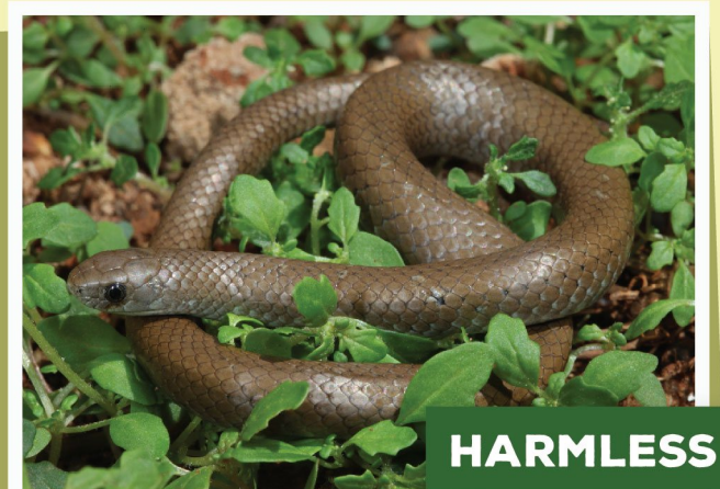
Common Slug-eater ( Duberria lutrix )