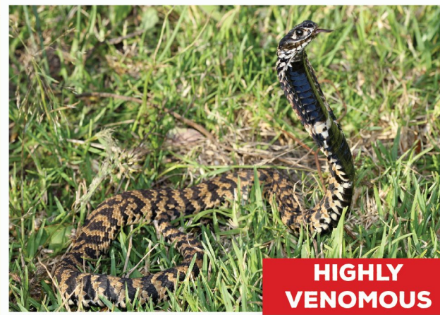
Rinkhals ( Hemachatus haemachatus )