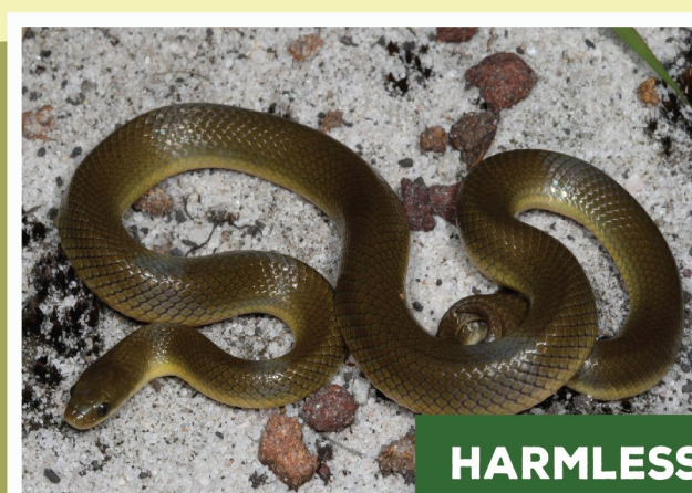
Yellow-bellied House Snake ( Lamprophis fuscus )