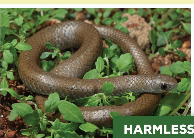
Common Slug-eater ( Duberria lutrix )