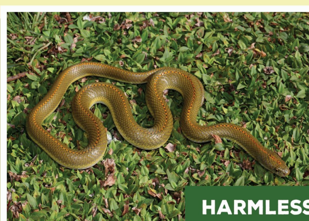
Aurora House Snake ( Lamprophis aurora )