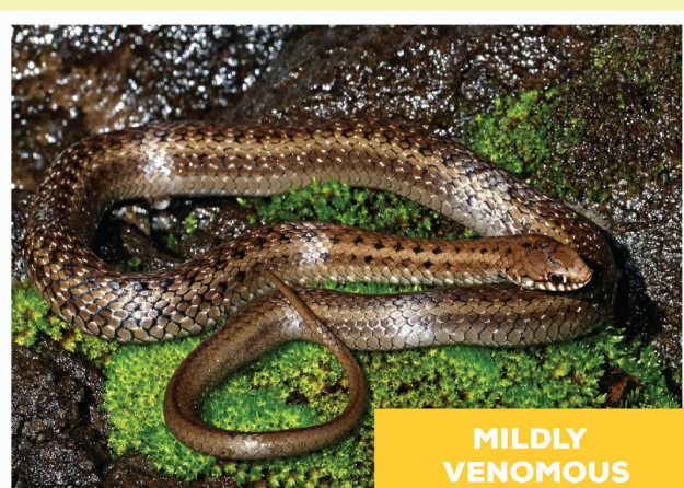
Many-spotted Reed Snake ( Amplorhinus multimaculatus )