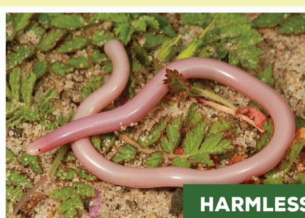
Delaland's Beaked Blind Snake ( Rhinoityphlops lalandei )