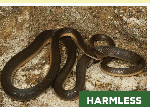
Common Brown Water Snake ( Lycodonomorphus rufulus )