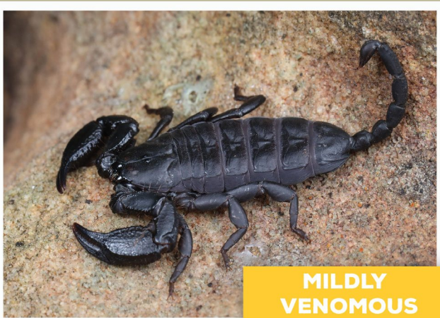
Cape Creeper ( Opisthacanthus capensis )