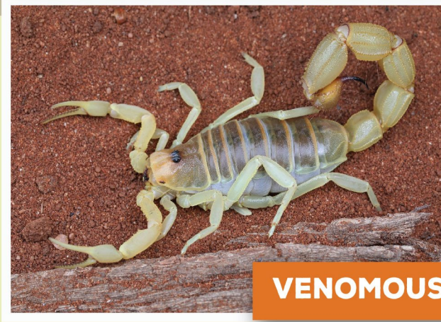
Kalahari Thicktail Scorpion ( Parabuthus raudus )