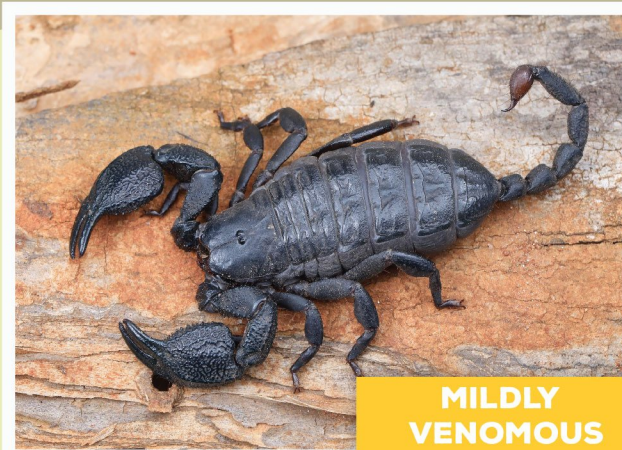
Drakensburg Creeper ( Opisthacanthus validus )