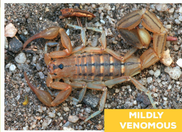
Common Lesser-thicktail Scorpion ( Uroplectes carinatus )