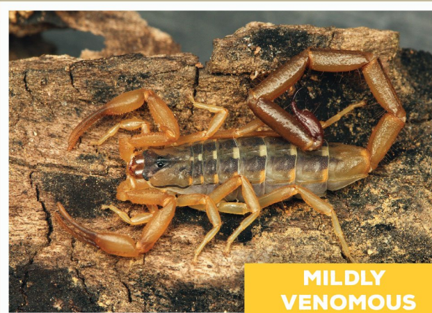
Eastern Bark Scorpion ( Uroplectes vittatus )