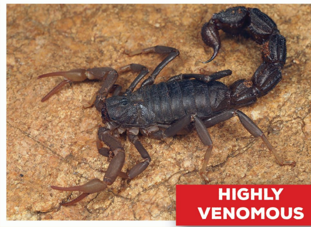
Transvaal Thicktail Scorpion ( Parabuthus transvaalicus )