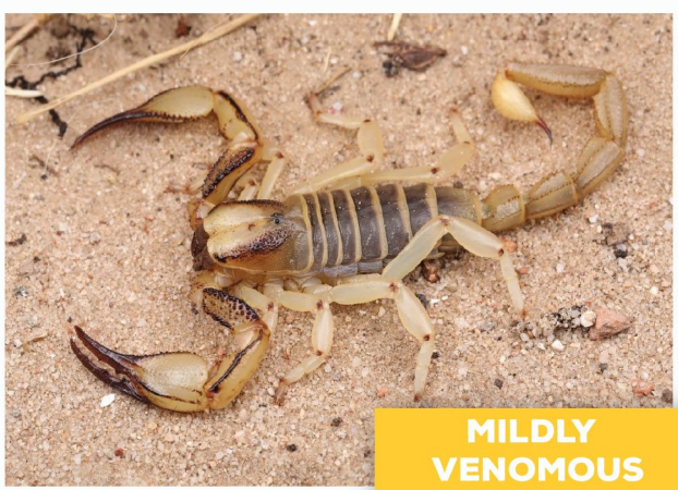
Cape Burrower ( Opisthophthalmus capensis )