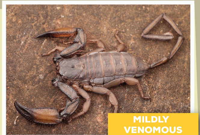
Giant Rock Scorpion ( Hadogenes troglodytes )