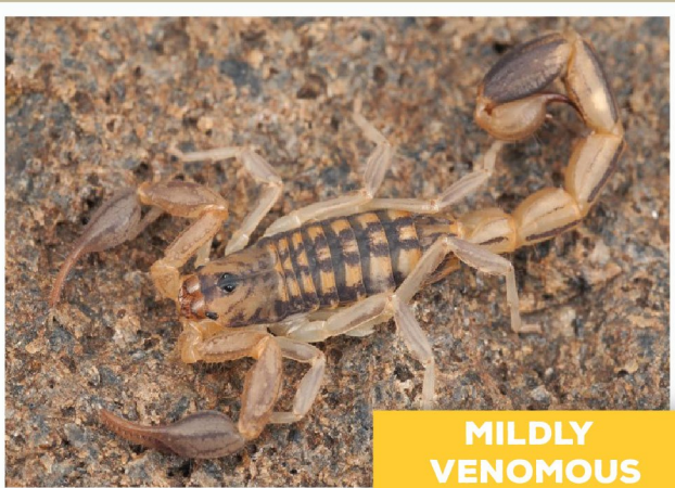
Striped Lesser-thicktail Scorpion ( Uroplectes lineatus )