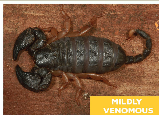
Tree Creeper ( Opisthacanthus asper )