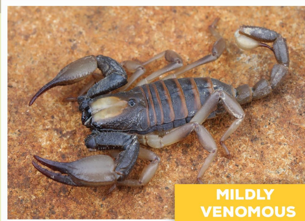
Karoo Burrower ( Opisthophthalmus karrooensis )