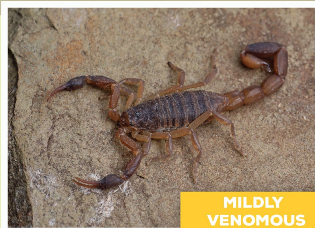
Plain Pygmy-thicktail Scorpion ( Pseudolychas ochraceus )