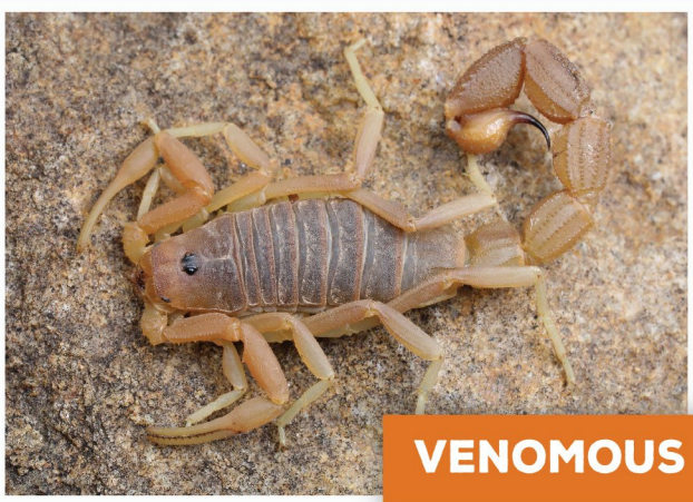
Drab Thicktail Scorpion ( Parabuthus planicauda )