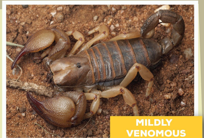
Rough Burrower ( Opisthophthalmus glabifrons )