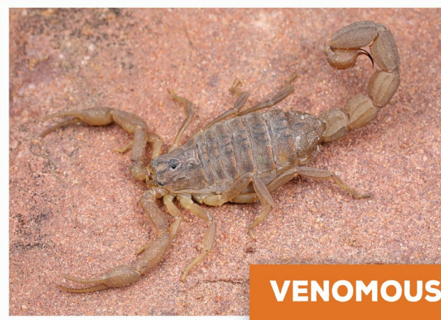
Eastern Nomad ( Hottentotta trilineatus )