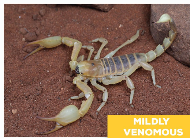
Kalahari Burrower ( Opisthophthalmus wahlbergii )