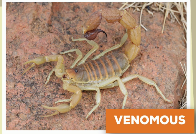
Cape Thicktail Scorpion ( Parabuthus capensis )