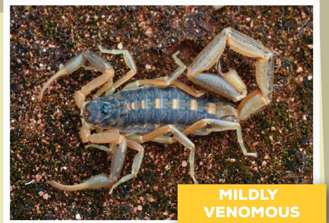
Highveld Lesser-thicktail Scorpion ( Uroplectes triangulifer )