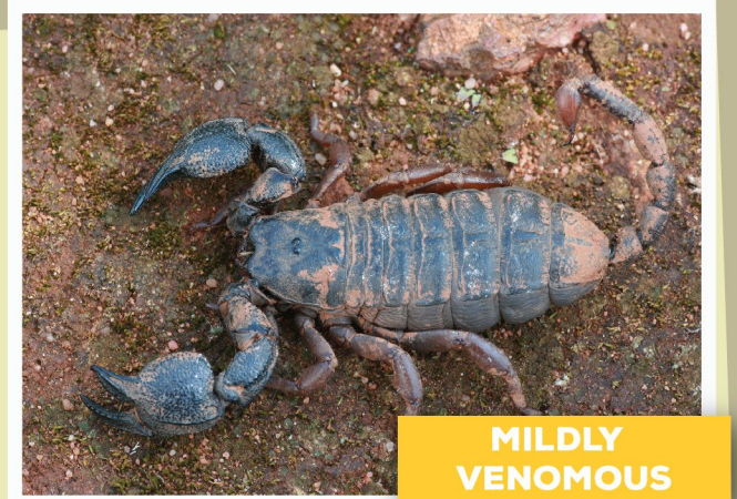
Jones's Creeper ( Cheloctonus jonesii )