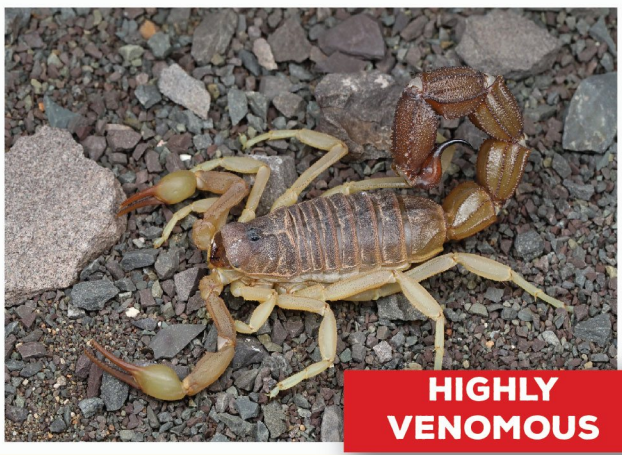
Rough Thicktail Scorpion ( Parabuthus granulatus )

Painful sting, but not thought to be harmful